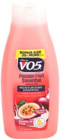
Full size shampoo