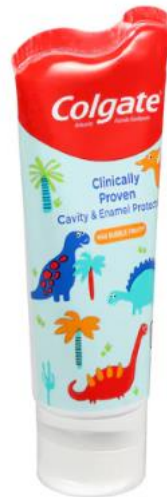
Full size toothpaste