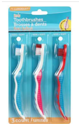
Individually wrapped toothbrush

A bag that is easy to pack and transport items