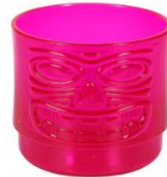
Plastic Rinse Tumbler